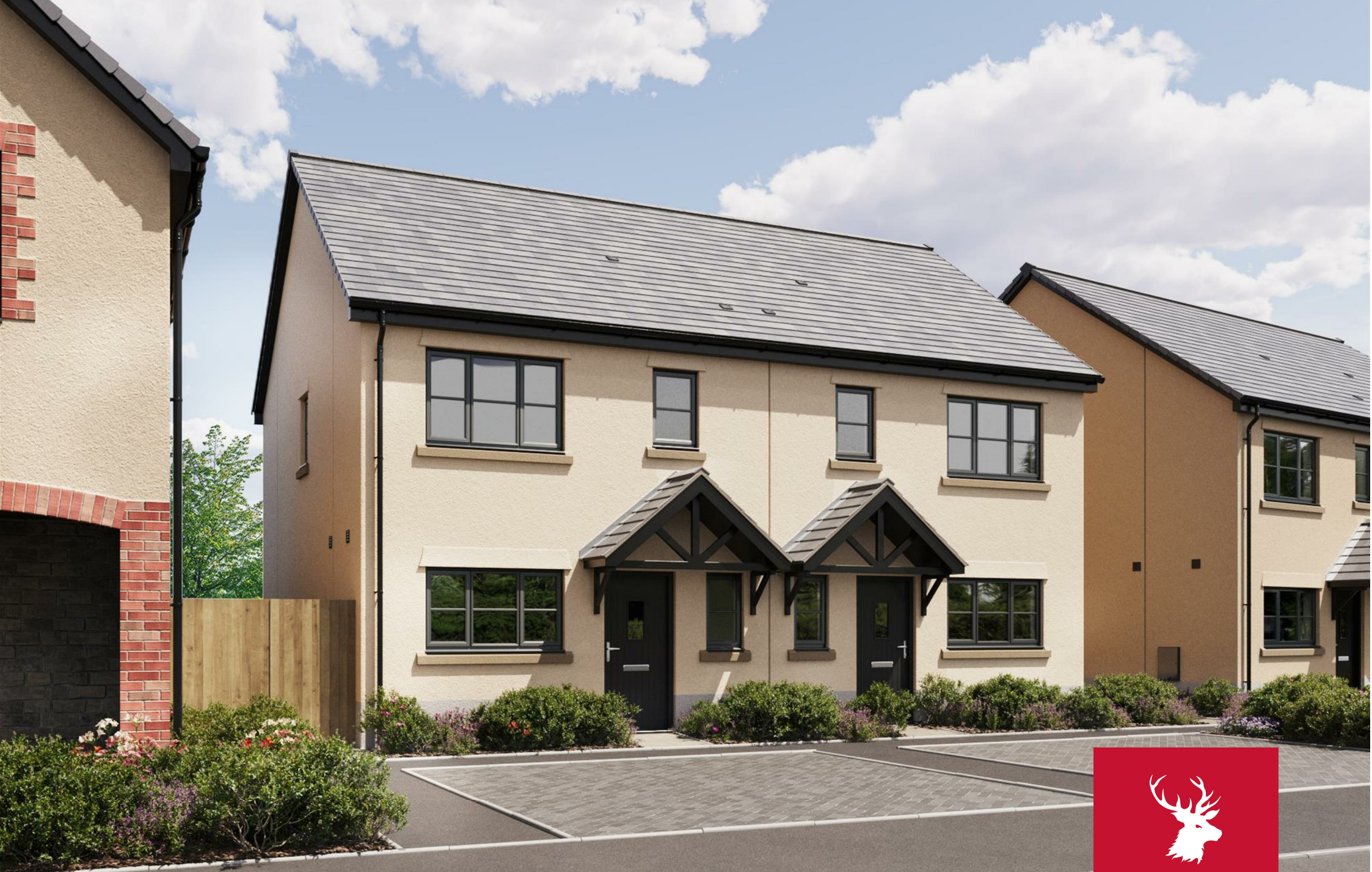
Plot 29 - The Lambourne